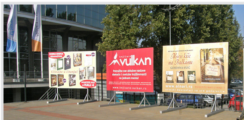
Billboard 300x200 cm, paper 240 €/piece pcs.