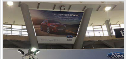
Megaboard at Hall 1, V-banner, vinyl, 735x427 cm 990 €/piece pcs.