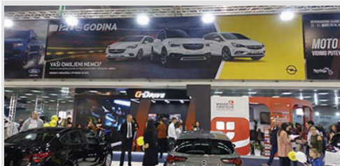
Advertising surface on the vinyl per sq.m. 33 €/sq.m sq.m