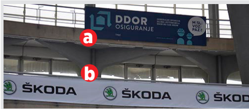
a) Billboard 6x1.5m 170 €/piece pcs. b) Vinyl on railing above the stand 33 €/sq.m sq.m