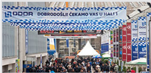
Colonnade in front of the Hall 2 vinyl 8x1 m, incl. 4 billboards, 95x195 cm 580 €/piece pcs.