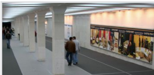
Megaboard, Underground Passage, 995x195 cm, paper, illuminated 520 €/piece pcs.