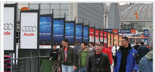
Double sided billboard on the pedestrian bridge, 95x195 cm, paper 105 €/piece pcs.